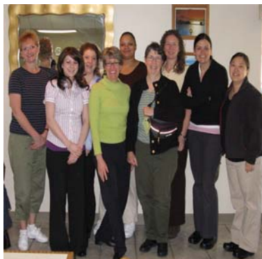
Occupational Therapy Department