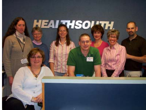
HealthSouth "Green Team"

Our confidential papers as well as addressographs, computer tapes, and cd's go into the shredding bins.